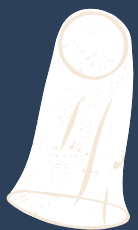
Internal Condom (inserted in a vagina)