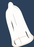
External Condom (worn on a penis)